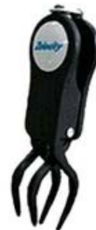
The MarkMender in its closed position. Cranman Golf Products