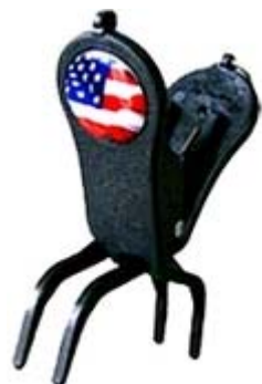
The MarkMender in its open position. Cranman Golf

We feature PGA Award winning products, great price, free Birdies www.birdieball.com